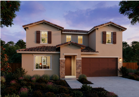
Residence 3A | Tuscan

This expansive Residence 3 Floor Plan boasts 4 bedrooms, 3 baths, and a loft within its generous 2,426 sq. ft., complete with a 2-car garage. The open-concept layout defines graceful living and entertainment spaces. Escape to the master suite for your private retreat, and relish outdoor gatherings in the backyard. Indulge in elevated living, surrounded by amenities and parks. Your dream home awaits!