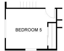
OPTIONAL BEDROOM 5 ILO LOFT