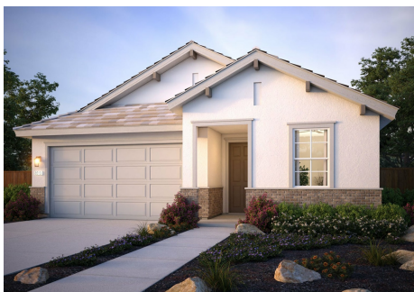
Residence 2 | Bay Area Bungalow