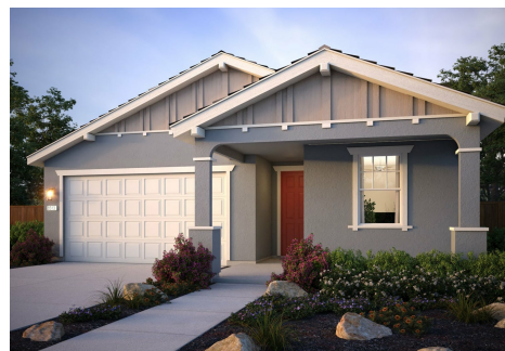
Residence 2 | Craftsman Bungalow

All renderings are artist's conception. Actual porch and window configuration varies from artists renderings. DeNova Homes reserves the right to make changes in price, material, and specifications without notice and without liability for such changes. Broker cooperation welcome. Sales & marketing by DeNova Homes Sales, DRE #01247582 Equal Housing Opportunity.