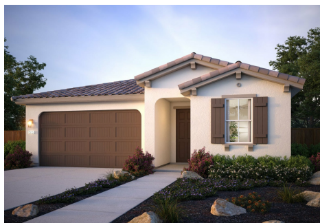
Residence 2 | Spanish Bungalow

Gorgeous single-level home in Rio Vista's newest 55+ Active Adult Community! 1,435 Sq. Ft. (approx.) of living space, 2 bedrooms, 2 baths, and a 2-car garage! This floor plan has plenty of room to entertain friends and family with a spacious kitchen island overlooking the dining area, an expansive Great Room, and an optional covered patio to entertain and dine al fresco. This home also includes a large owner's suite with an adjoining private bath, a walk-in closet, and so much more! Please see the Sales Agent for complete details.