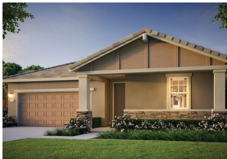
Residence 1B | Craftsman Elevation