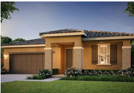
Residence 1A | Tuscan Elevation

vanity mirrors. This home also comes with hand-laid 18" x 18" ceramic tile flooring at Entry, Kitchen, Dining Room, and Owner's Bathroom, hand-laid 12" x 12" ceramic tile flooring in all secondary baths and Laundry, designer selected carpet in all other rooms including stairs, smart thermostat, tankless water heater, a video doorbell, and much more! Please see the Sales Agent for complete details.