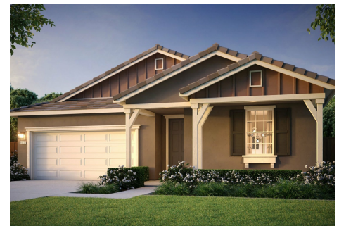
Residence 1C | Farmhouse Elevation

All renderings are conceptual. Actual colors and window coverings may vary. DeNova Homes reserves the right to change specifications, price, material, and specifications without notice and without liability for such changes. Broker cooperation welcome. Sales & marketing by DeNova Homes Sales, DRE #01247582 Equal Housing Opportunity