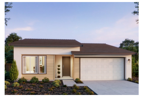
Residence 1B | Midcentury Modern Ranch