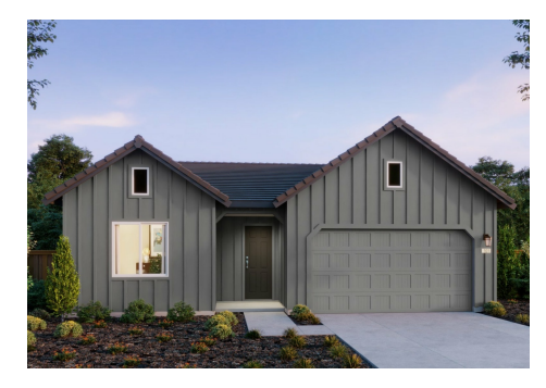
Residence 1A | Modern Farmhouse

These single-story bungalows exude an inviting ambiance, featuring fenced yards and covered patios that evoke the timeless charm of classic bungalows. This plan is perfect for those seeking a harmonious blend of comfort and luxury in a community that fosters an active and vibrant lifestyle. Please see the Sales Agent for complete details.