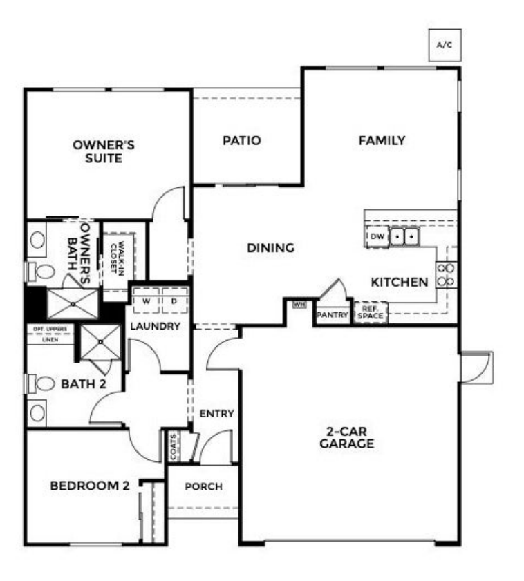
Bungalows - Residence 1