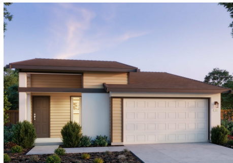
Residence 2B | Mid Century Modern Ranch House

All renderings are artist's conception. Actual porch and window configuration varies from artists renderings. DeNova Homes reserves the right to make changes in price, material, and specifications without notice and without liability for such changes. Broker cooperation welcome. Sales & marketing by DeNova Homes Sales, DRE #01247582 Equal Housing Opportunity.