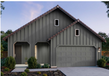
Residence 2A | Modern Farmhouse

Whether hosting gatherings or enjoying a quiet evening, the open-concept design of Bungalow Plan 2 ensures that every moment is spent in comfort and style.