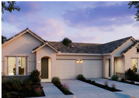
Residence 1E | Modern Cottage

All renderings are artist's conception. Actual porch and window configuration varies from artists renderings. DeNova Homes reserves the right to make changes in price, material, and specifications without notice and without liability for such changes. Broker cooperation welcome. Sales & marketing by DeNova Homes Sales, DRE #01247582 Equal Housing Opportunity.