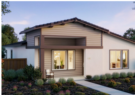
Residence 1B | Midcentury Modern Ranch