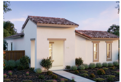
Residence 1C | Modern Spanish