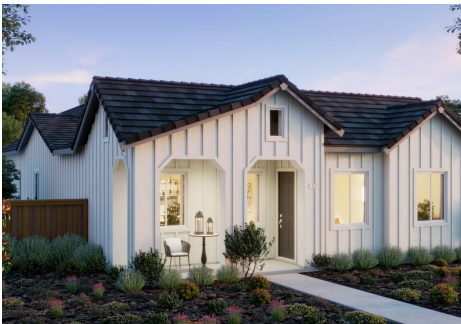
Residence 1A | Modern Farmhouse

1,564 Sq. Ft. 1 Story 2 Bed 2 Bath 2 Car Garage