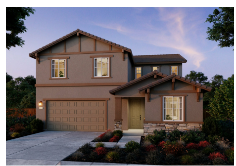
Residence 2B | Craftsman