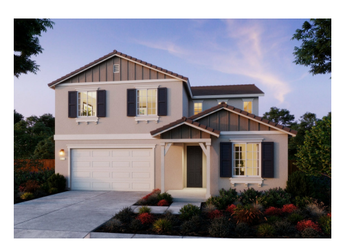
Residence 2C | Modern Farmhouse