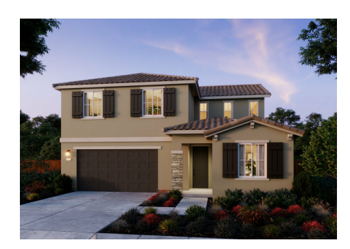
Residence 2A | Tuscan

The Residence 2 Floor Plan is a luxurious modern dwelling in Martinez, CA. This 4-bedroom, 3-bath home spans 2,182 sq. ft. and includes a loft and a 2-car garage. Its open-concept design creates elegant living and entertaining spaces. The master suite offers a personal escape, while the backyard is primed for outdoor gatherings. Experience elevated living in this stylish gem, conveniently situated near amenities and parks. Your ideal home awaits.