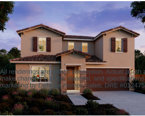
Residence 2A | Tuscan