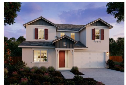
Residence 2C | Modern Farmhouse