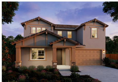
Residence 2B | Craftsman