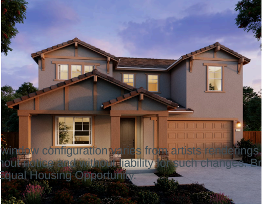
Residence 2B | Craftsman