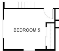
OPTIONAL BEDROOM 5 I/O LOFT