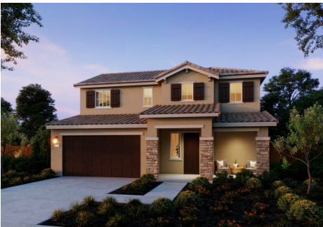
Residence 1A | Tuscan

Introducing the Residence Floor Plan, this 3-bedroom, 2.5-bath residence spans 1916 sq. ft. with a 2-car garage. An open-concept layout invites you into stylish living and entertaining spaces. The master suite offers a private retreat, while the backyard is perfect for outdoor gatherings. Elevate your lifestyle in this modern gem, conveniently located near amenities and parks. Your dream home awaits.