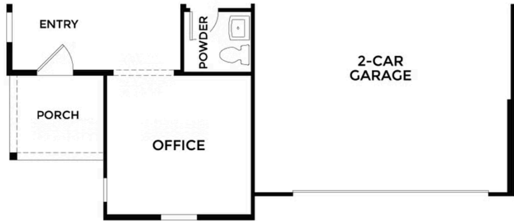
ELEVATION FARMHOUSE FIRST FLOOR