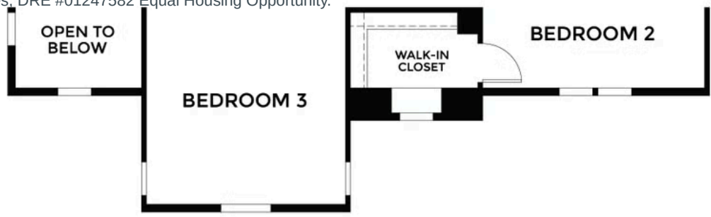
ELEVATION FARMHOUSE SECOND FLOOR (SAME AS SPANISH)