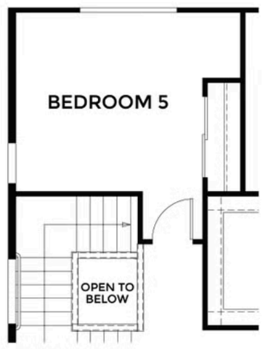
OPTIONAL BEDROOM 5 ILO LOFT