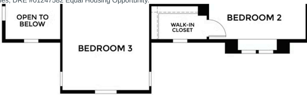
ELEVATION PRAIRIE SECOND FLOOR