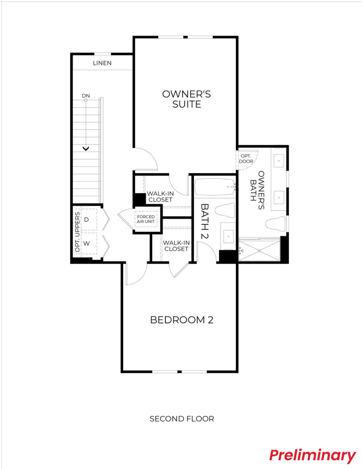
Residence 1 | Second Floor