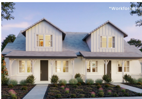
Residence 1 | Farmhouse

Please see the Agent for complete details.