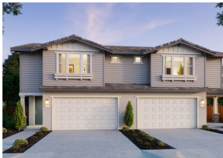
Residence 2B | Craftsman