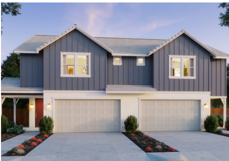
Residence 2A | Farmhouse

Please see the Agent for complete details.