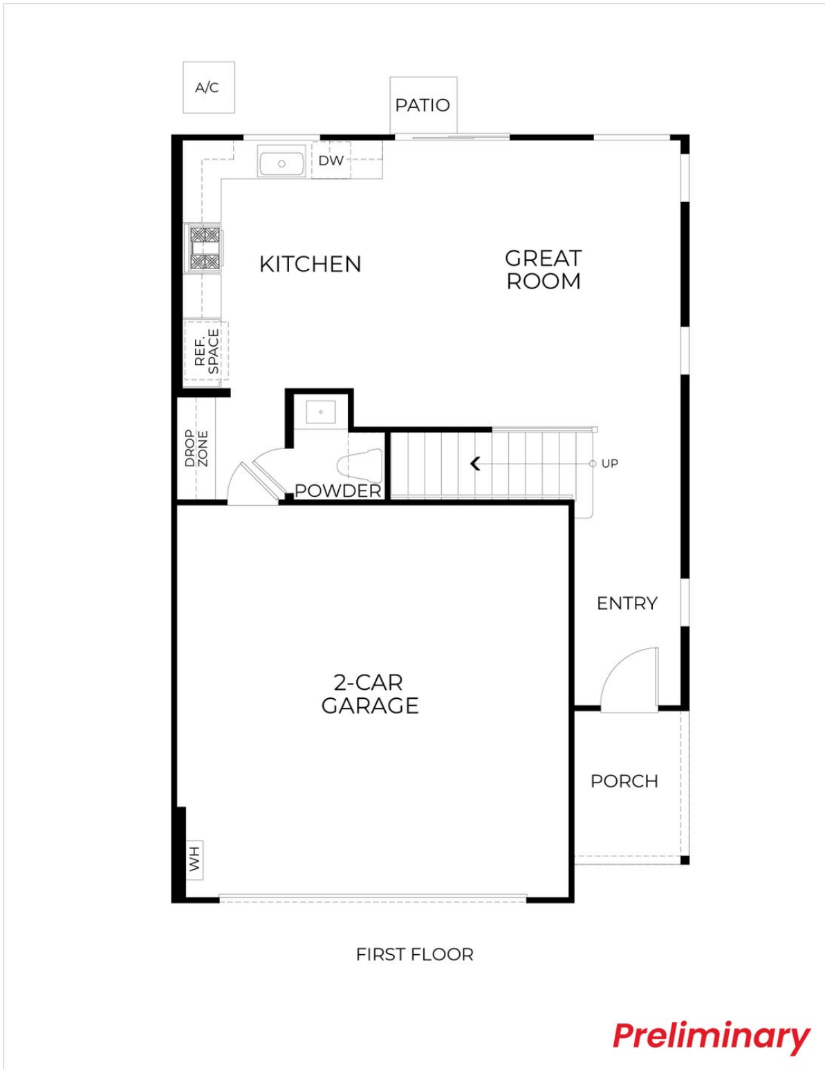
Residence 2 | First Floor