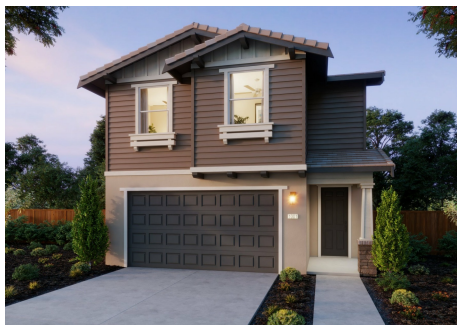
Residence 3B | Craftsman