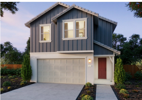
Residence 3A | Farmhouse

Please see the Agent for complete details.