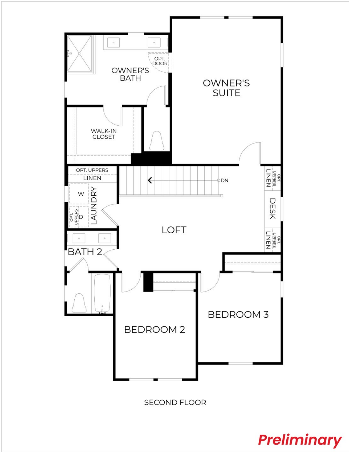
Residence 3 | Second Floor