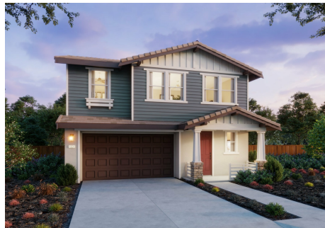
Residence 4B | Craftsman