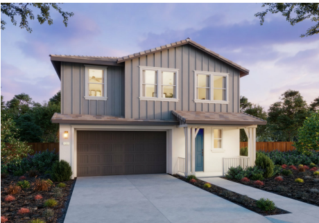
Residence 4A | Farmhouse

Please see the Agent for complete details.